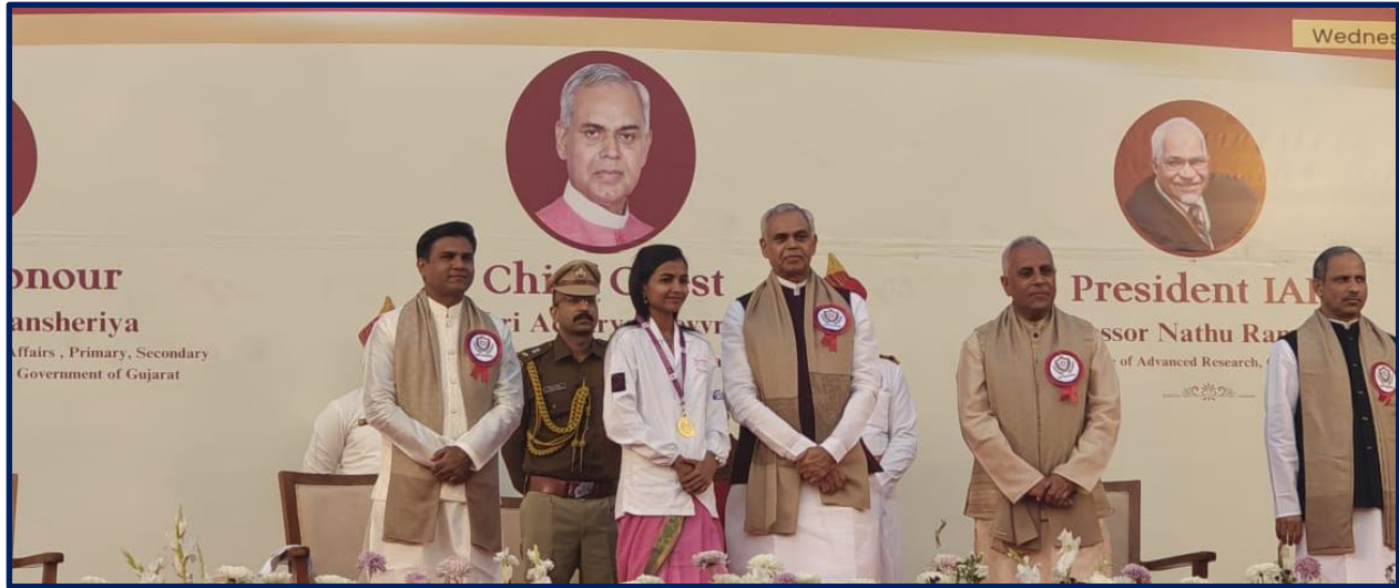
Glimpse of convocation event

On December 18, 2024, the Institute of Advanced Research, Gandhinagar, Gujarat, hosted a grand Convocation Ceremony to honor the achievements of 58 female students who successfully completed skill training under the AmNeev Project.