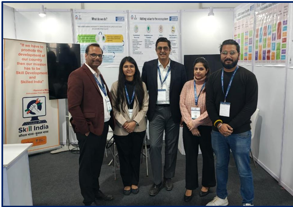
Glimpse of CPHI event in the Center- CEO LSSSDC

From November 26 to 28, 2024, the Life Sciences Sector Skill Development Council (LSSSDC) proudly showcased its Skill India initiatives and the PMKVY scheme at the 17th edition of CPHI & PMEC India. Through a dedicated display booth, LSSSDC leveraged the event as a strategic platform to engage with industry leaders and professionals from the life sciences sector, fostering connections on both national and international fronts.