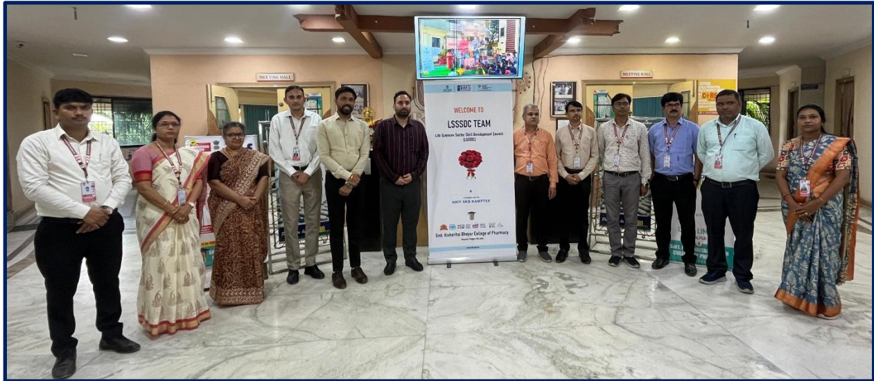
Glimpse of the Launch event

Life Sciences Sector Skill Development Council (LSSSDC) proudly announces the launch of its first skilling program under the Mahatma Jyotiba Phule Research & Training Institute (MAHAJYOTI) initiative. This groundbreaking program is a fresh skilling and certification drive aimed at empowering underrepresented communities across Maharashtra.