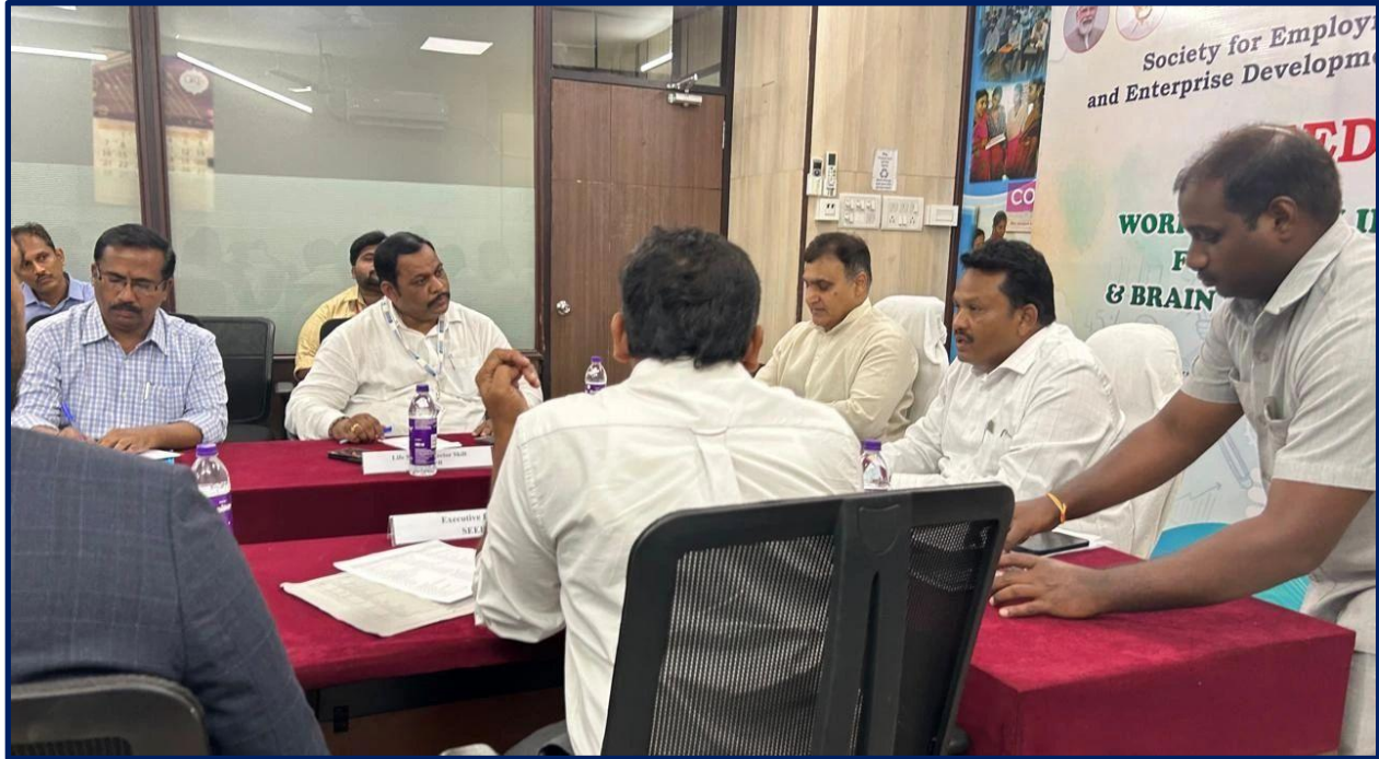
Glimpse of the workshop at SEEDAP

Life Sciences Sector Skill Development Council (LSSSDC) proudly represented the life sciences sector at the SEEDAP Andhra Pradesh Workshop held on October 28, 2024. This pivotal session highlighted the industry's growing manpower requirements, with valuable contributions from leading industry representatives, including Neuland Laboratories Limited and MSN Laboratories.