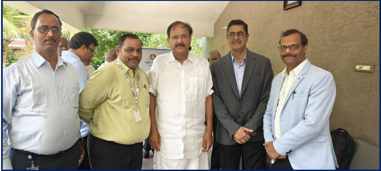
Glimpse of MOU event in the Center- Shri M. Venkaiah Naidu

On October 19, 2024, the Life Sciences Sector Skill Development Council (LSSSDC) has proudly host a CSR Project MOU Signing and Exchange Ceremony in collaboration with Swarna Bharat Trust and Suven Pharma. The event was held in the esteemed presence of the Honourable Former Vice President of India, Shri M. Venkaiah Naidu Garu.