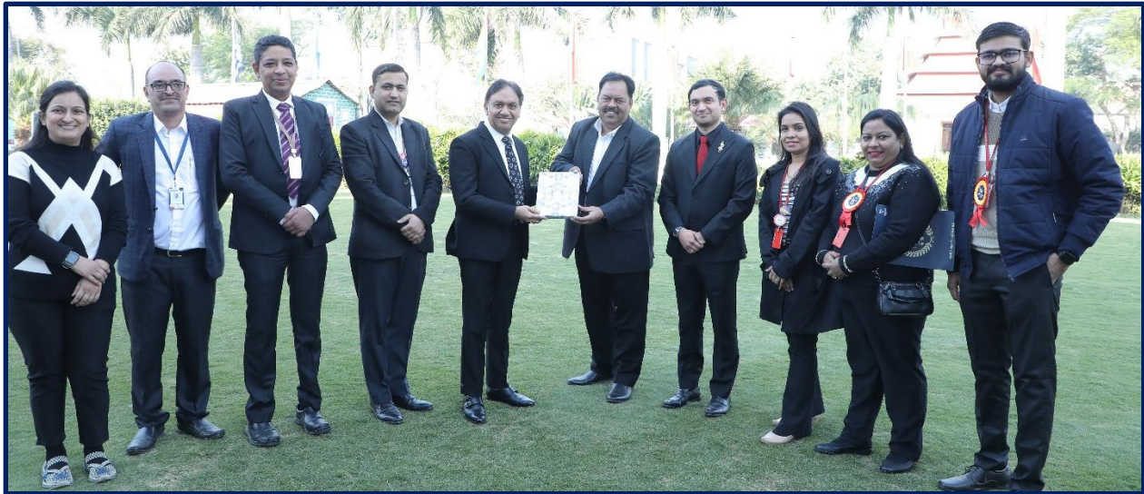
Glimpse of the Graduation Ceremony at Venus Remedies

LSSSDC extends its heartfelt congratulations to Venus Remedies Limited on the successful completion of its inaugural Graduation Ceremony, where over 100 graduates were celebrated for their achievement in skill development programs. These graduates, having undergone rigorous training, are now equipped to contribute effectively to the pharmaceutical sector.