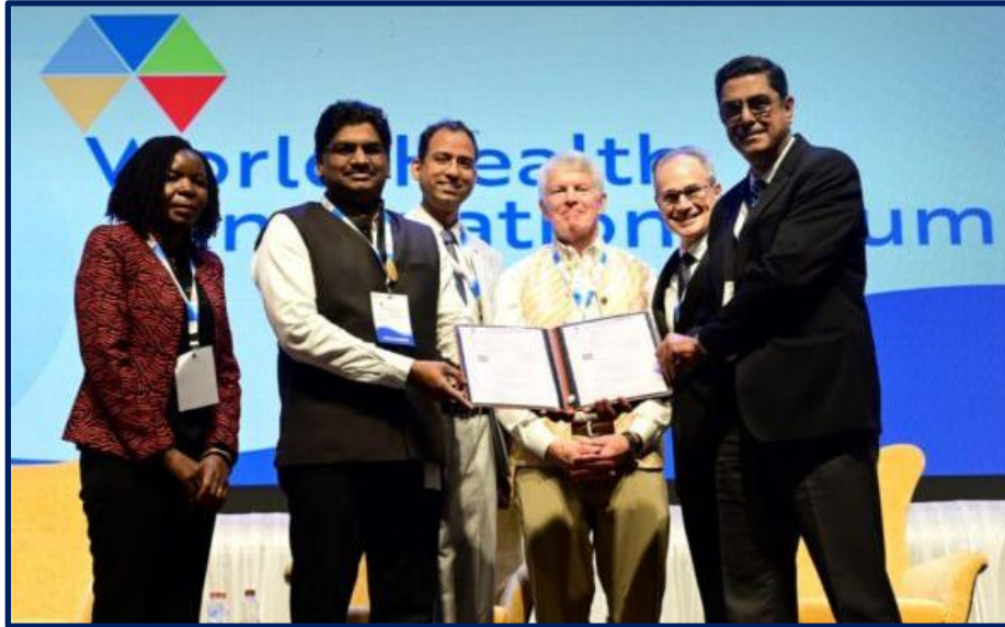
Glimpse of the MoU Signing Event with AMTZ

Life Sciences Sector Skill Development Council (LSSSDC), the National Vocational Education Awarding Body for the Medical Devices Sector, has signed a landmark Memorandum of Understanding (MoU) with AMTZ, the premier Medical Devices Park in Andhra Pradesh.