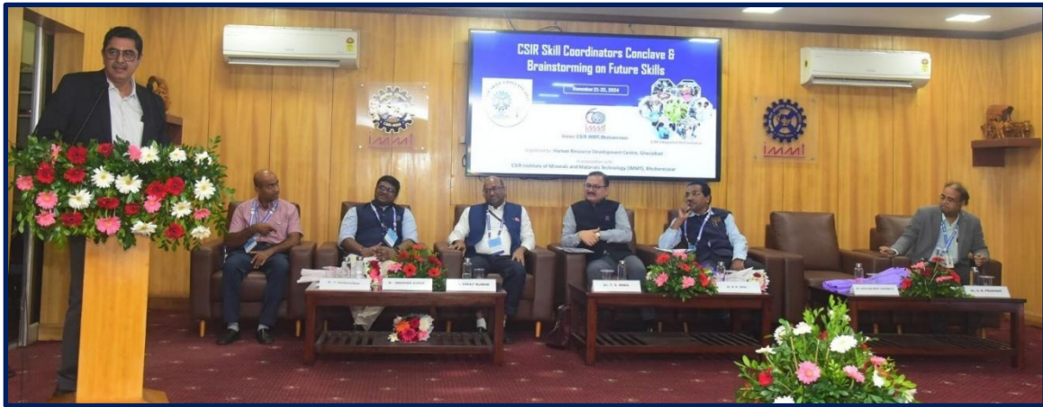
Glimpse of the Conclave

The Life Sciences Sector Skill Development Council (LSSSDC) participated as a guest speaker at the “CSIR Skill Coordinators’ Conclave & Brainstorming on Future Skills” held on November 21-22, 2024, at CSIR-Institute of Minerals and Materials Technology (CSIR-IMMT), Bhubaneswar.