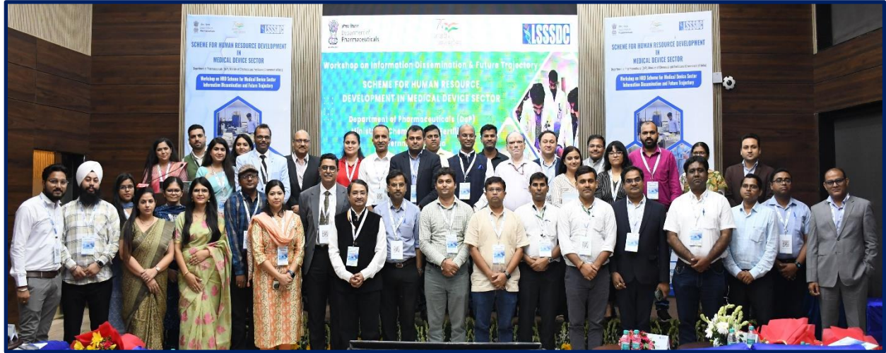
Glimpse of the workshop event

Imaging Diagnostics. The application submission deadline for the HRD Scheme has also been extended to August 14, 2024, allowing more time for applicants. These initiatives underscore LSSSDC's commitment to fostering a robust and skilled future workforce for India's medical device sector.