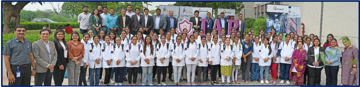
Glimpse of the AmNeev Project Launch Day

L ife Sciences Sector Skill Development Council (LSSSDC), in partnership with Amneal Pharmaceuticals, launched the AmNeev – Empowering Women initiative at the Institute of Advance Research (IAR) in Gandhinagar, Gujarat. Aligned with the goals of the National Education Policy (NEP) 2020, this program aims to equip women with vital skills to bridge the skill gaps in the pharmaceutical sector. Through a three-month training program featuring hands-on experience and industry visits, AmNeev provides participants with the expertise required for roles in Quality