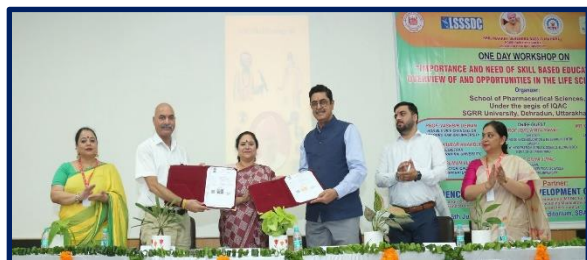
Glimpse of the MoU Signing event

Life Sciences Sector Skill Development Council (LSSSDC) participated in a workshop at SGRR University, Dehradun, titled "Importance and Need of Skill-Based Education with an Overview of Opportunities in the Life Sciences Sector". The event, organized by the School of Pharmaceutical Sciences under IQAC, emphasized the importance of skill-based education in the