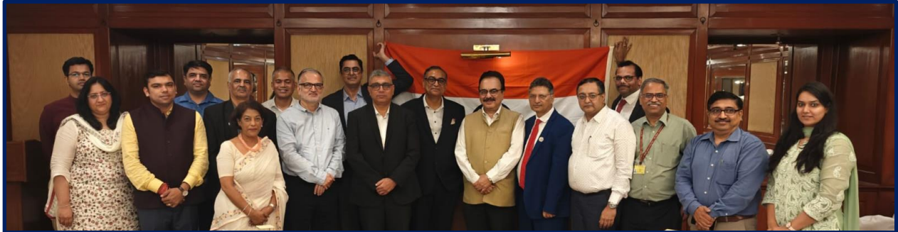
Glimpse of the Governing Board Meeting

L ife Sciences Sector Skill Development Council (LSSSDC) successfully conducted its 41st Governing Board Meeting on Friday, August 9, 2024, marking its first-ever physical gathering. Governing Board members engaged in meaningful discussions on LSSSDC's accomplishments and strategic roadmap for the future.