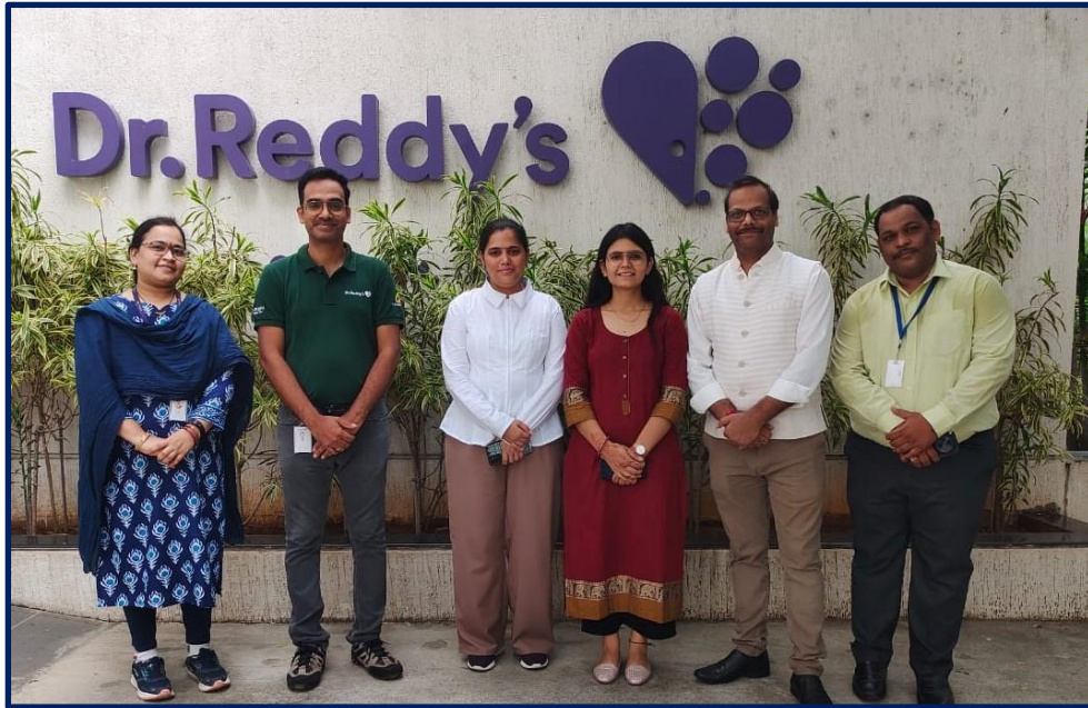
Glimpse of the visit at Technical Training Center at Dr. Reddy's Laboratories (DRL)