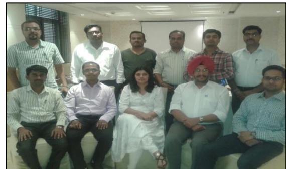
Batch of Trainers in 29 th TTT Program

LSSSDC has conducted its 29 th TTT workshop based on the revised model of TTT suggested by NSDC.